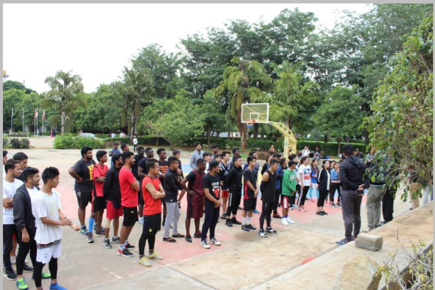
Players before the matches