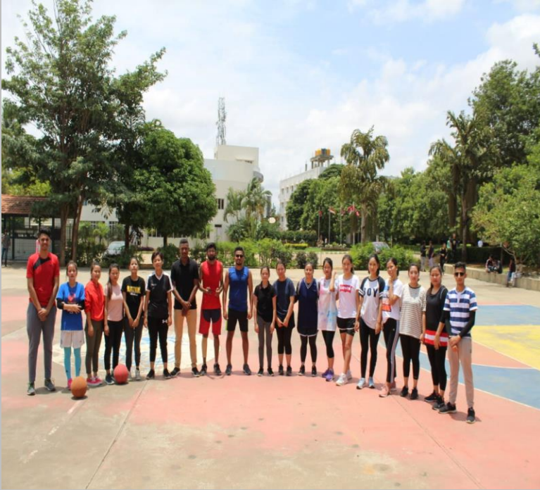
Players with referee and officials.