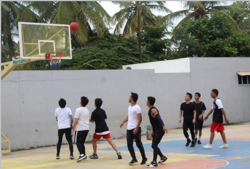
Players in actions.