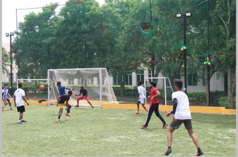
PLAYERS IN ACTIONS